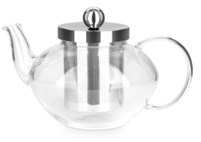
Pimlico 3-Cup Glass Teapot with Infuser Case Size:8 342717