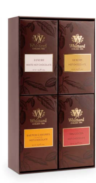
Hot Chocolate Classic Collection 560g Case Size:6 360750