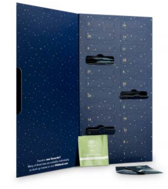
The Tea Advent Calendar 96g Case Size:6 358432