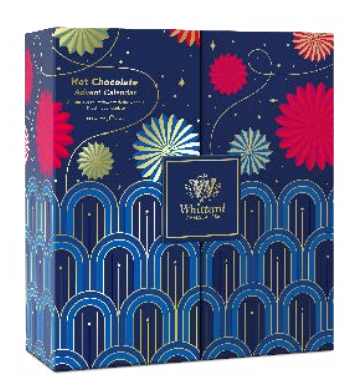
Hot Chocolate Advent Calendar 480g Case Size:6 360974