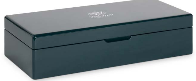
Lacquer Box Case Size:6 355826