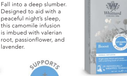
Boost 40q Case Size: 6 358085