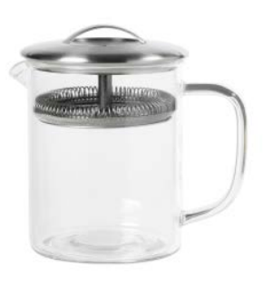
Greenwich 2-Cup Glass Teapot with Infuser Case Size:6 338830

To make perfect tea and coffee you need the finest equipment available. For over a century we have provided customers with the latest and greatest equipment to make their luxury brews.