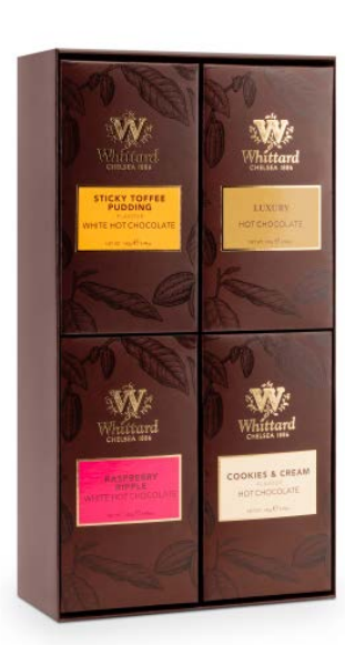
Hot Chocolate Dessert Collection 560g Case Size:6 360743