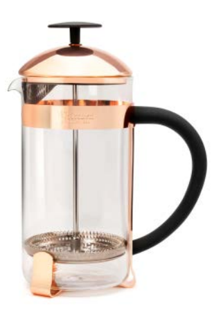
Cafetière 8-Cup Cooper Cafetière Case Size:6 355115